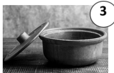
3. clay pot