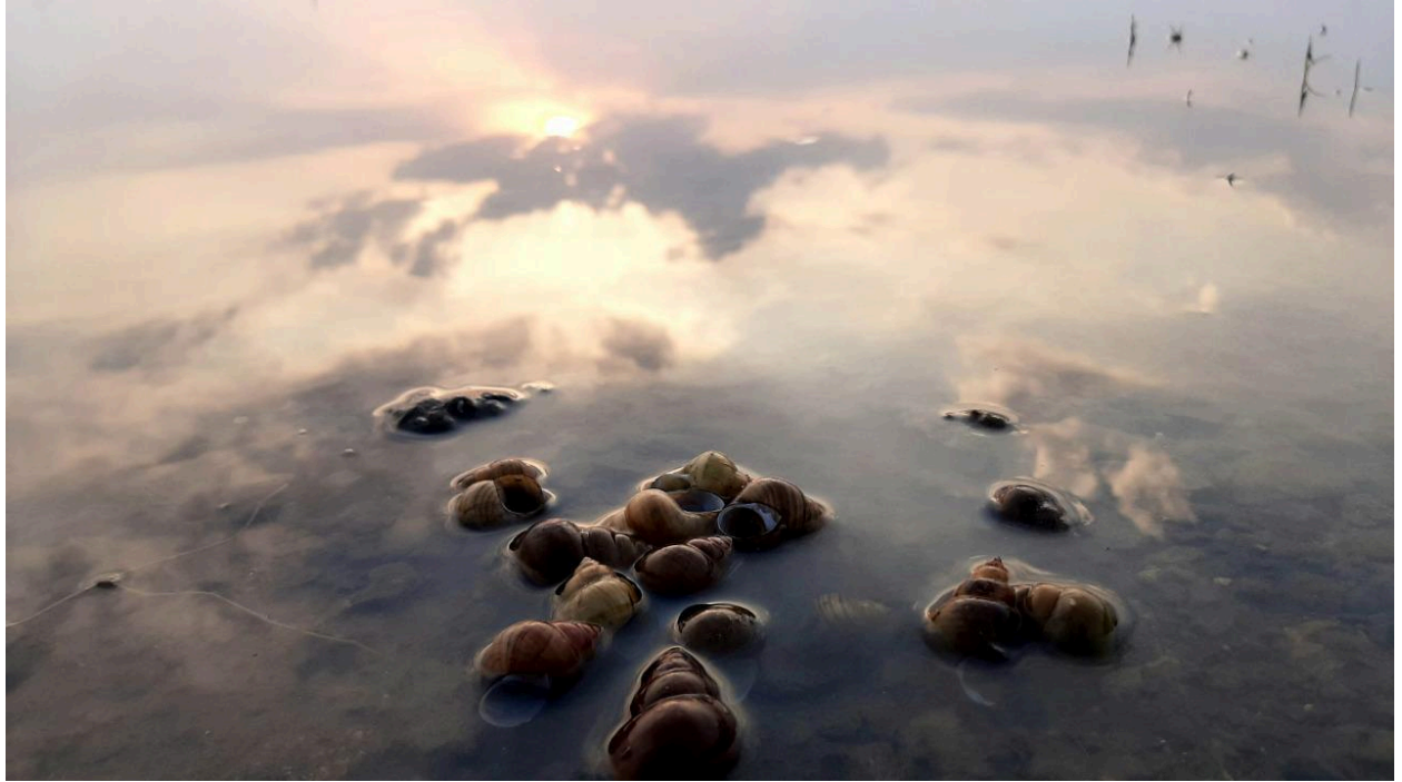
Figure 5: Consolation: Reflection of our deeds (By Satyaprem Ghatul)