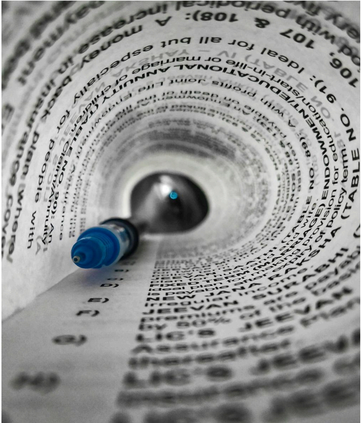
Figure 2: First runner up: Exams or no exams (By Shubham Wakchaure)