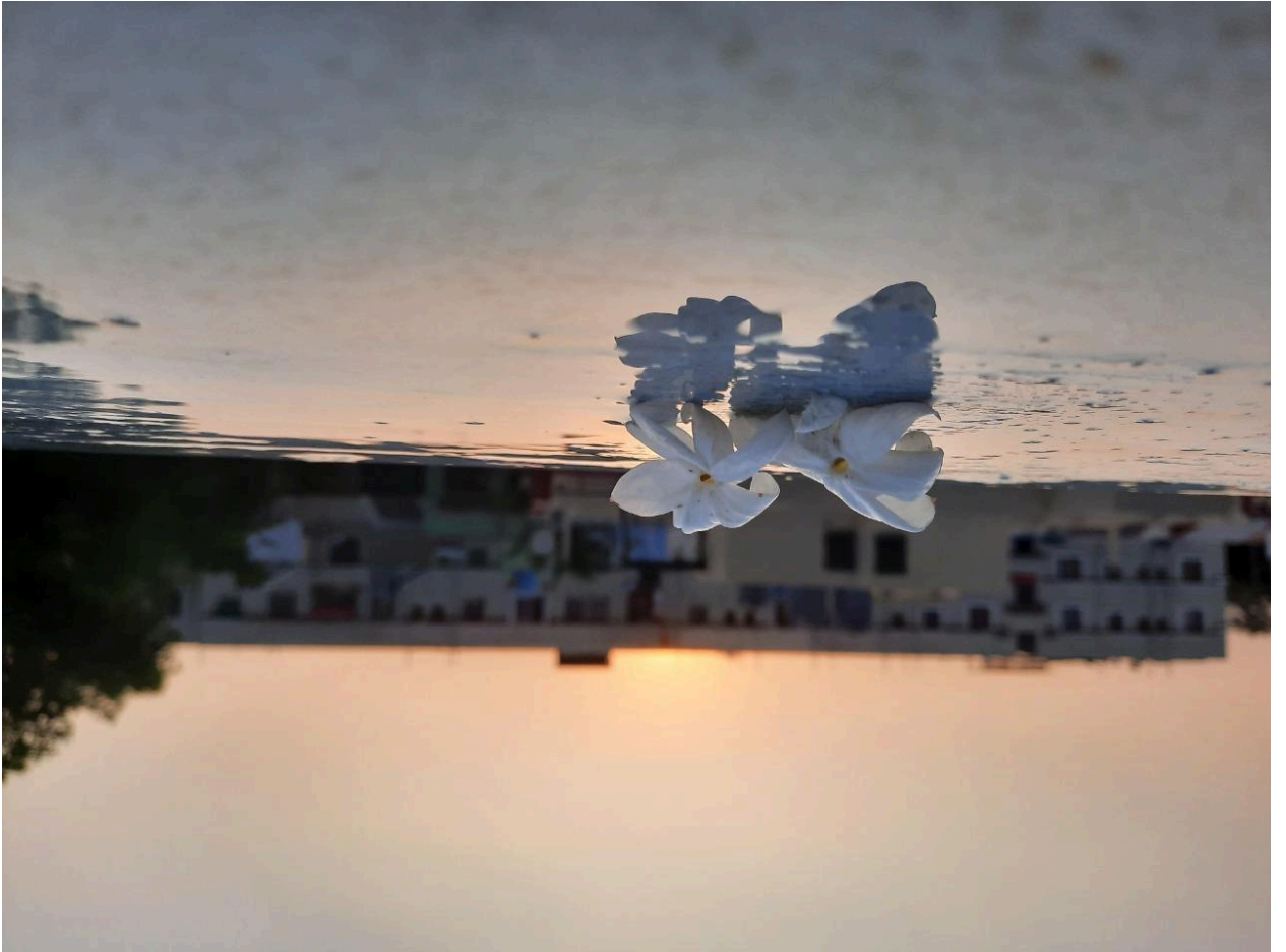
Figure 4: consolation: Time to change the perspective (By Vedant Sawant)