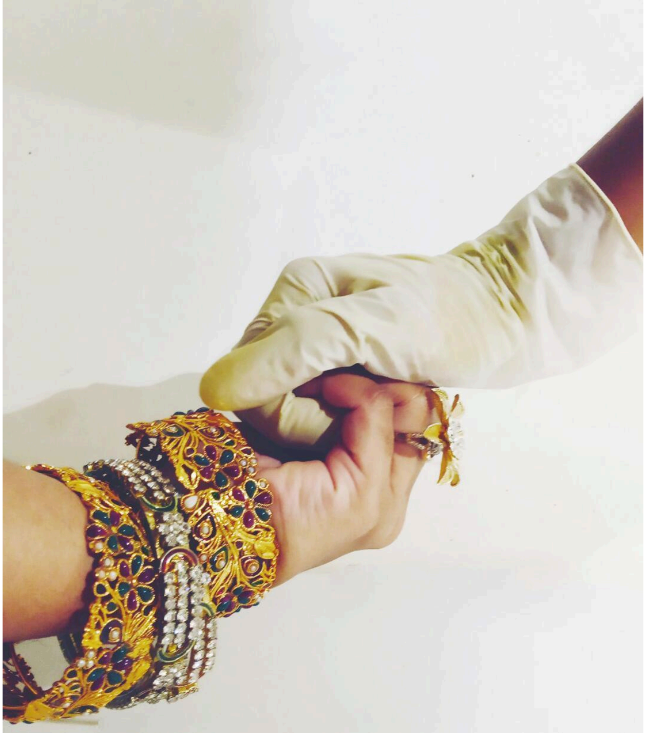
Figure 1: First winner: Promise of Protection (by Miss Steffy Nadar)