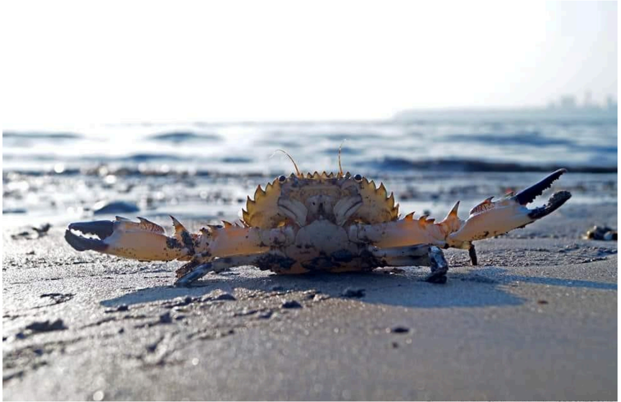
Figure 6 Return to the Coast