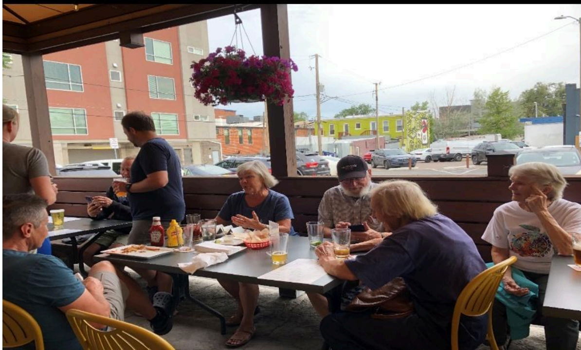
Enjoying the patio at Federal Bar and Grill