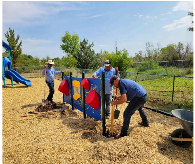
Parkview Music Station