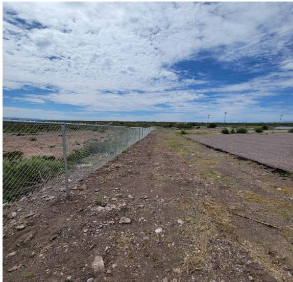
Fencing/Old Equipment from Baseball Field