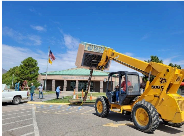
Removal of old Parkview Sign