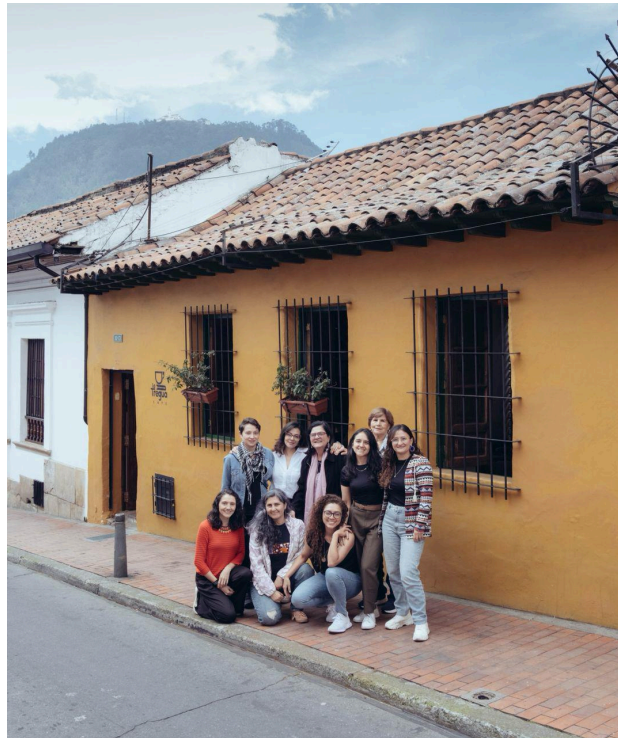
Mesa de Economía Feminista de Bogotá