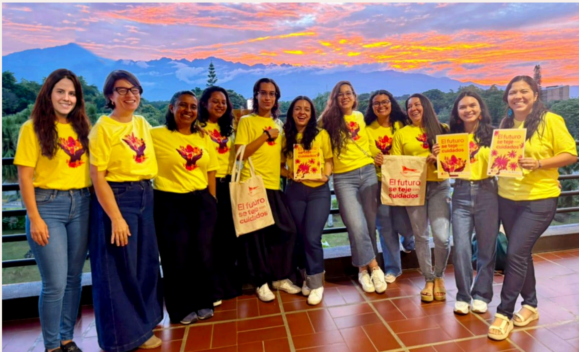
Observatorio para la Equidad de las Mujeres