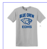
Blue Crew Shirt Grey