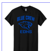
Blue Crew Shirt Black