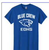
Blue Crew Shirt Blue