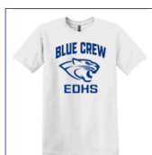
Blue Crew Shirt White