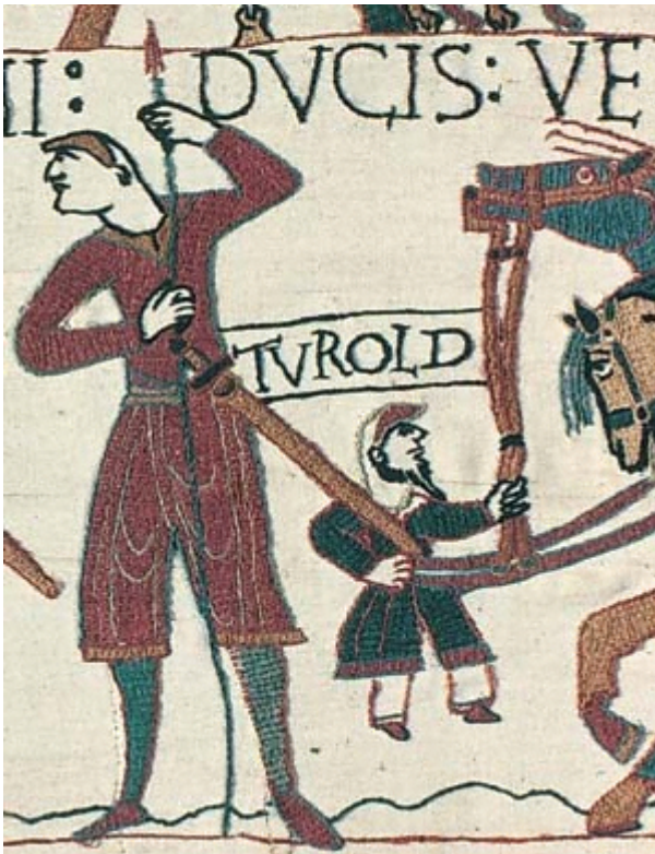
The enigmatic Turol