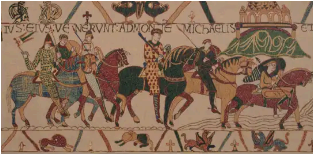
Note Mont St. Michel in the upper right corner.