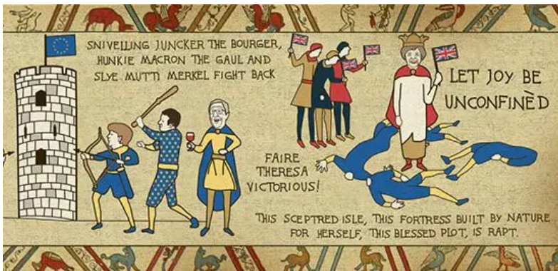
The "Bye EU" tapestry