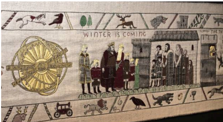
Game of Thrones