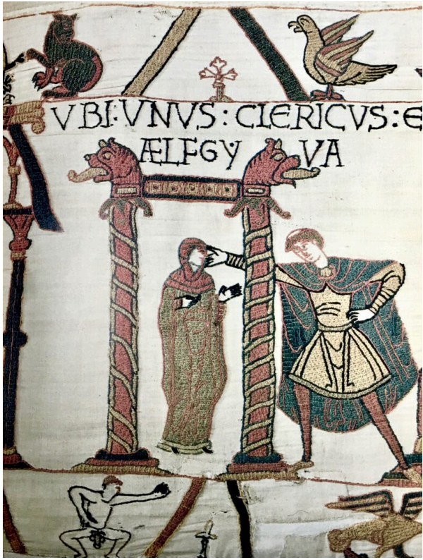
Ælfgyva and the cleric. Who was she and what was her role in the Norman invasion?