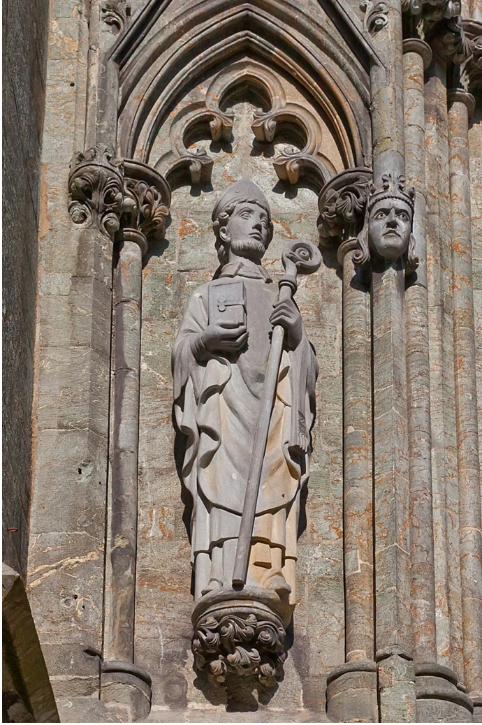
Trusty St Swithun helped Emma Ælfgyva out of a bind. But whose head is that?