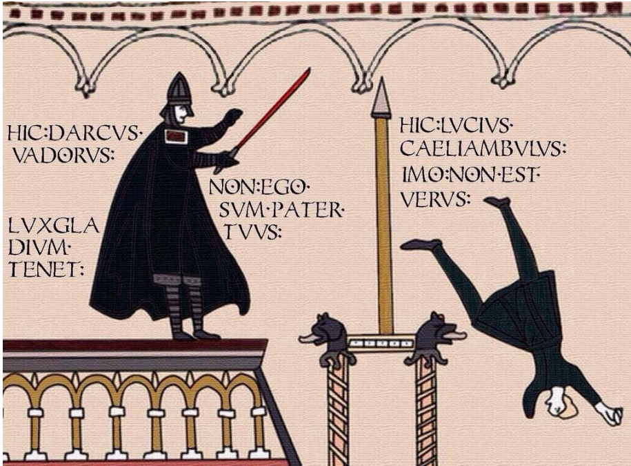
Close up of a scene from Bayeux Star Wars