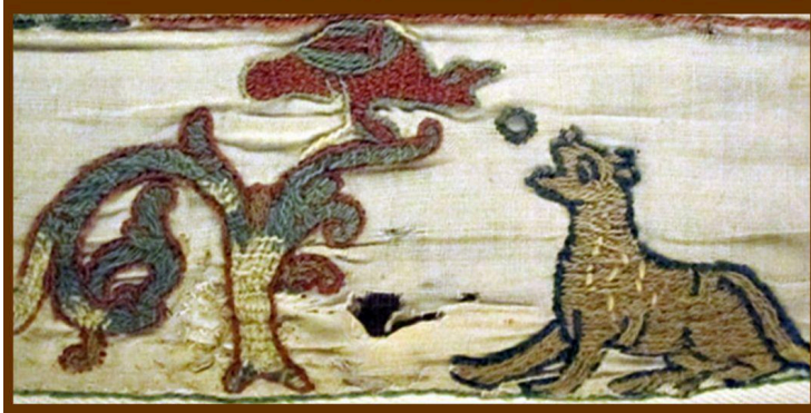
Aesop's fable The Fox and the Crow