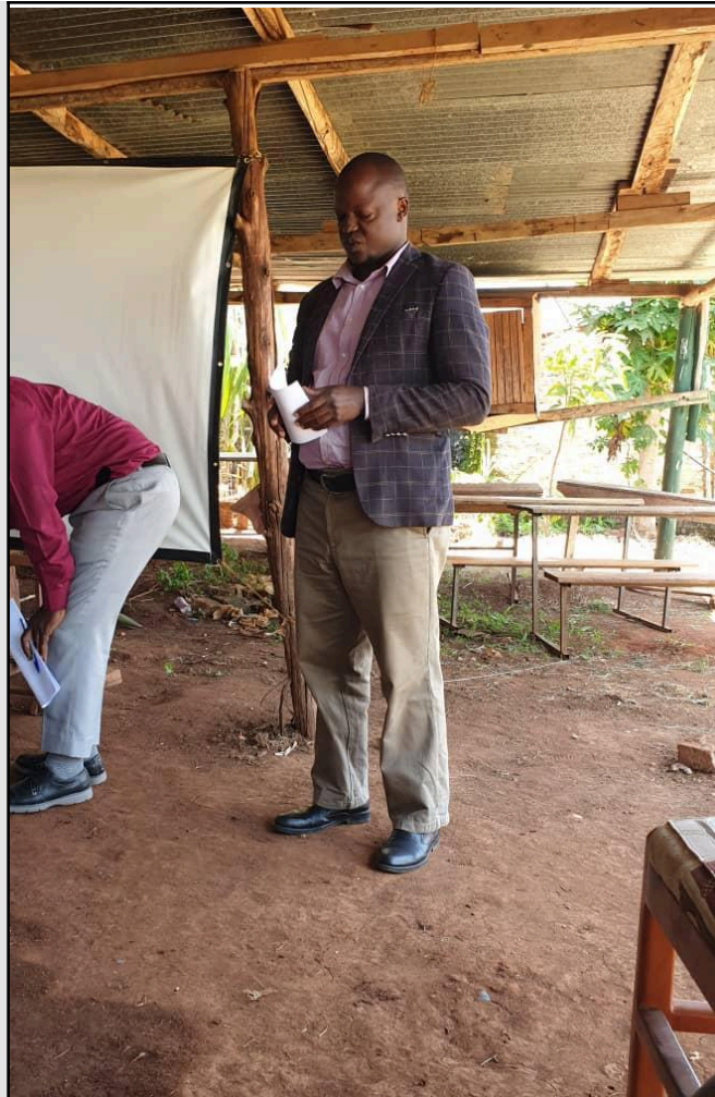
Town Clerk of Gombe Town council making his remarks about the MHM project