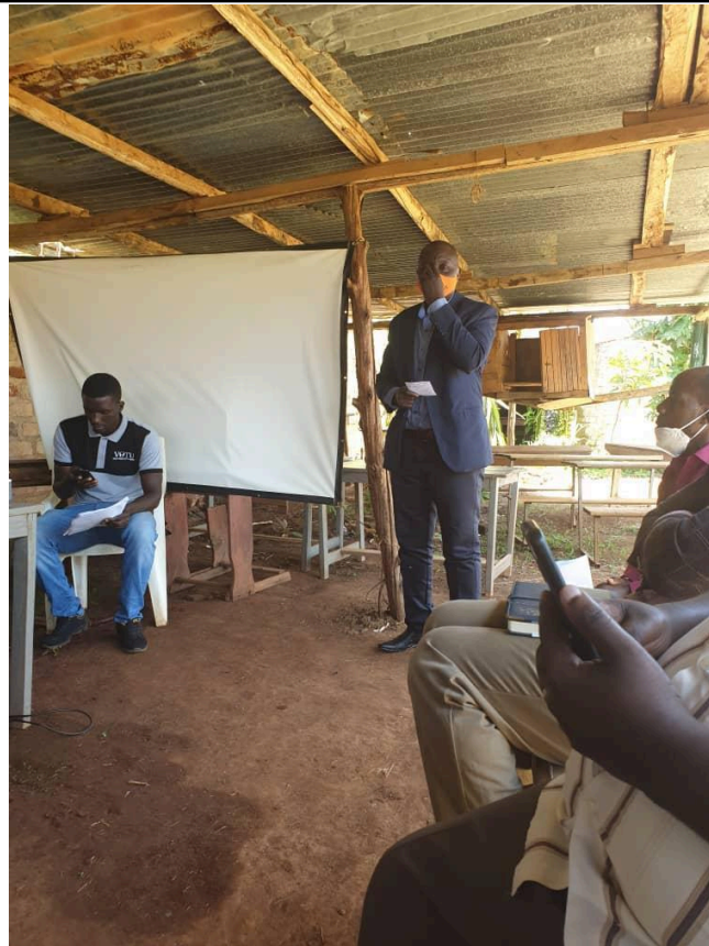
Head of Teacher's union representing the DEO