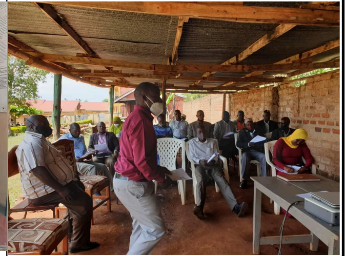
Team Leader Introduction of the project