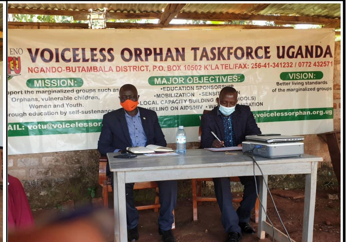
The DEO and the RDC of Butambala graced the meeting