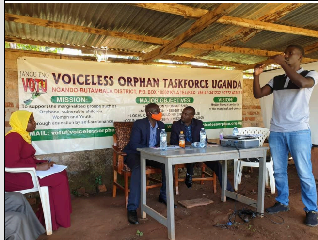
Project Manager discusses Project goals, Objective and activities