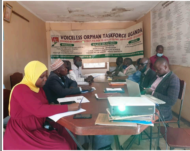
Arrival & Registration of stakeholders