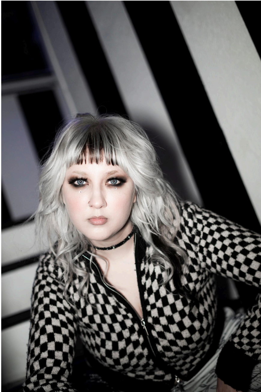
KOTA! Has shared her latest single, 'Eyes Wide Open'

Pop songs don't come much more inspiring than KOTA!'s new track 'Eyes Wide Open'. As the New Mexico artist shares the backstory of her acclaimed self-titled debut album, we take a look at how her latest single has become a shimmering song with a powerful modern-day message.