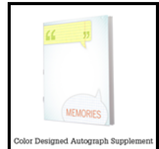
Color Designed Autograph Supplement