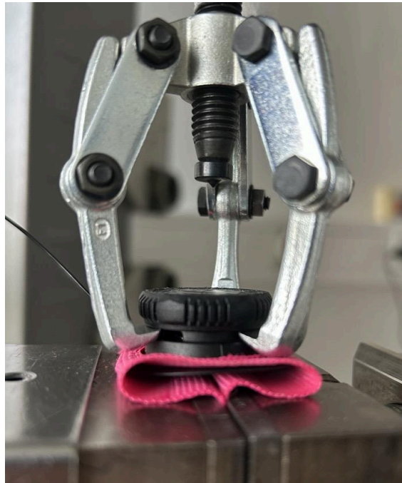
Figure 4: Three-armed jig grips underneath the lid