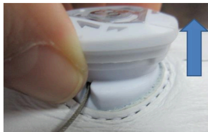
Figure 1: dial opening by lifting the cap upwards