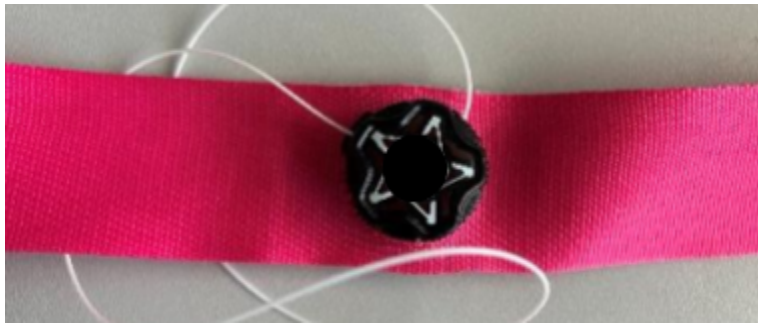
Figure 3: Dial mounted on a strap