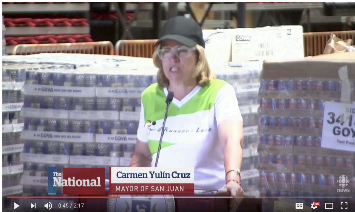
Trump slams mayors of Puerto Rico for wanting 'everything done for them'