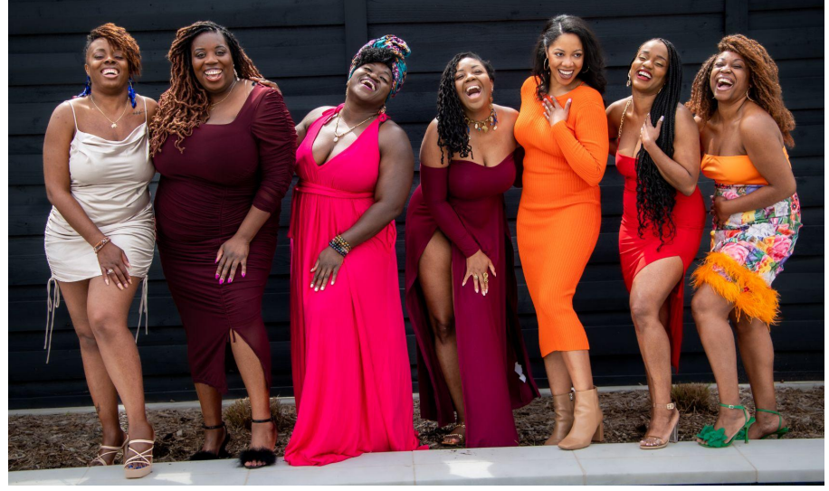
December 1-2, 2023 | Dallas, TX