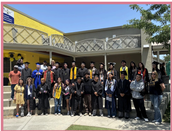
2025 Alumni Graduate Walkthrough

As we close out the year, we would like to thank you for all the work you have done to support the work that we do here at school. The more involved you are in your student's education, the better the outcomes for them tend to be. We appreciate your partnership and look forward to continuing this work during the 2025-2026 school year. We hope that your summer is filled with moments of beauty, and joy and that you are able to build new family memories together. Have a wonderful break and we will see you and your students back on August 20th. 🌴