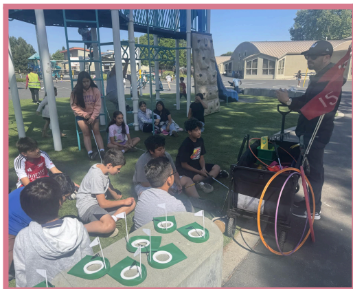
PE Golf Lesson