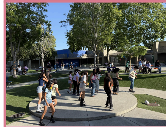
End of the Year Dance