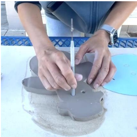
Using back of the metal tool create eyes, nose, and buttons of the snowman. Use the metal scraper to create the smile. Add creative details to the hat.