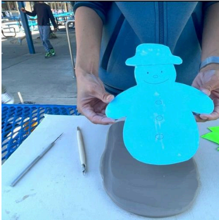
Overview of the supplies required.