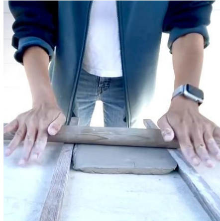
Volunteer will help roll out clay 1/2 " thick. Use 2 wooden guides to keep the thickness consistent.