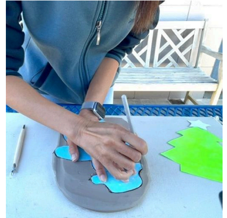
Using the snowman template and the metal tool, cut out the clay into a snowman shape.