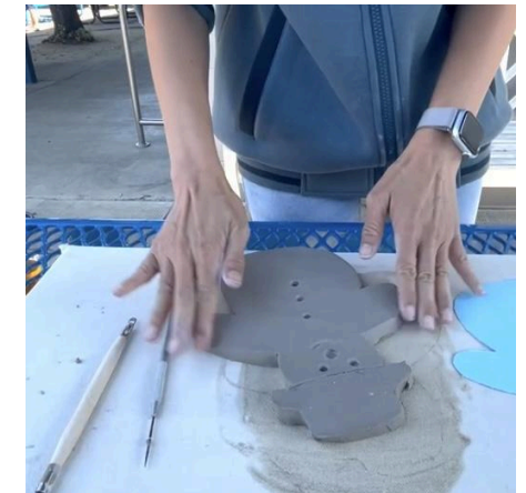
Smooth out fingerprints and/or any rough edges with slightly wet fingers.