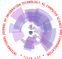
Figure 1. IJITA-CSC Logo

For table 1 or figure 1, the numbering must be linked in the explanation, and a specific explanation is given.