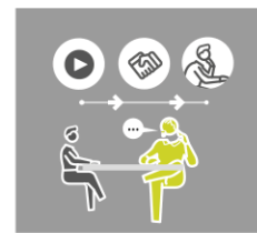
COMMIT & REVIEW