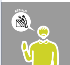
INITIATE A REBUILDING PROCESS