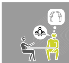
REINFORCE MUTUAL RESPECT & BELONGING