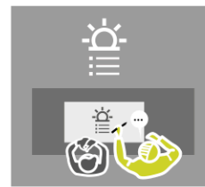
IDENTIFY SPECIFIC CHANGES