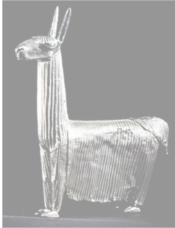
Alpaca, Inca silver figurine, 1200–1400ce; in the American Museum of Natural History, New York City.