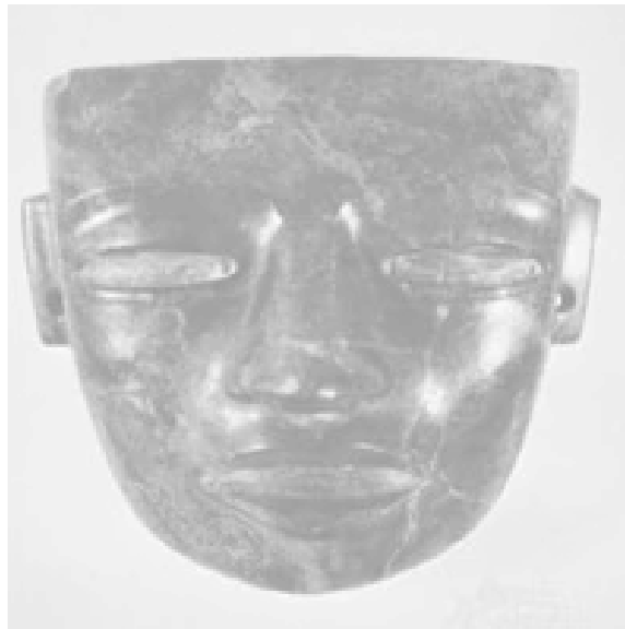
Ancient Mexican porphyry mask found north of Texcoco, Mexico, Teotihuacán civilization,