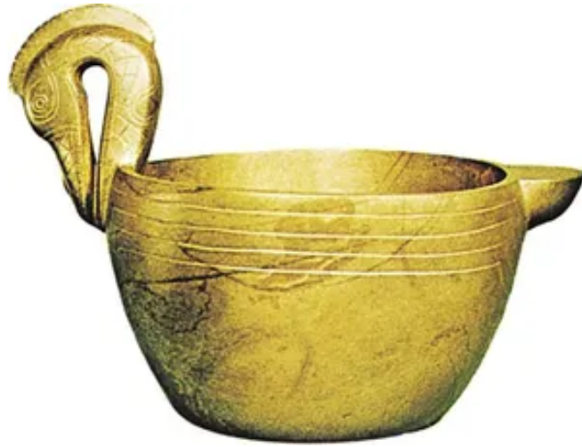
Middle Mississippian diorite bowl in the shape of a crested wood duck, from Moundville