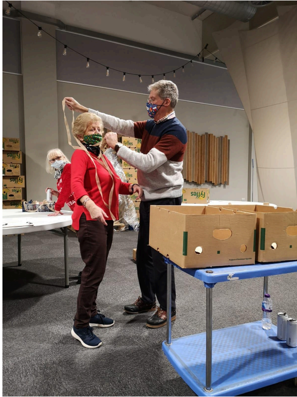
Cardboard banana boxes were turned into hampers.. Available to download here .