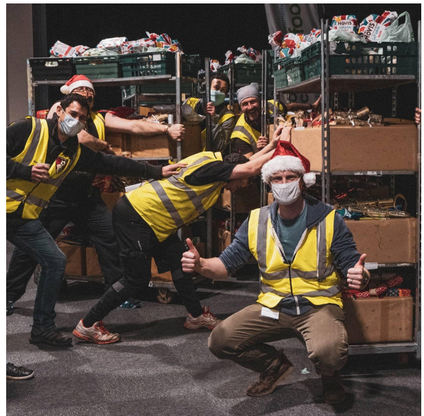
A large team helped support the deliveries. Available to download here .