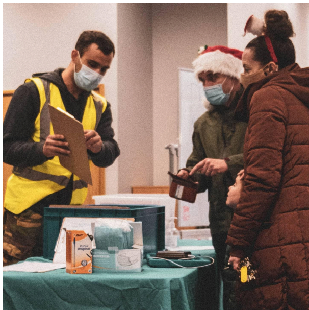
Volunteer drivers are briefed on their deliveries. Available to download here .