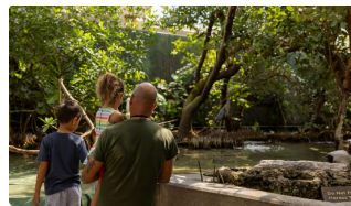
Wetlands of Florida