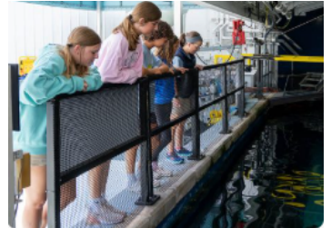
ALL AGES Behind the Scenes Tour