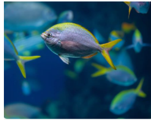
ALL AGES Fish Identification