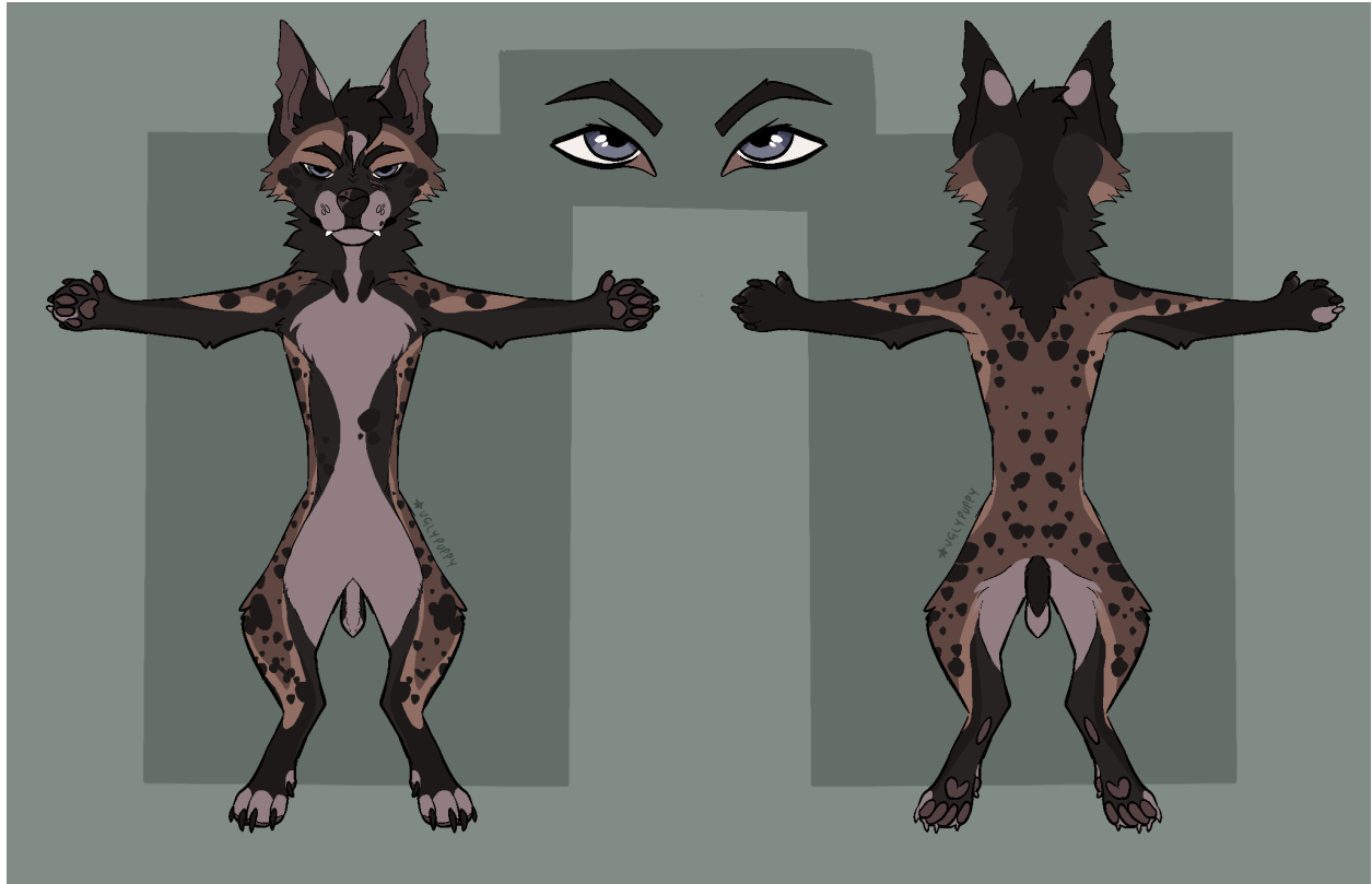
BASIC REFERENCE SHEET: $75ea front / back / headshot