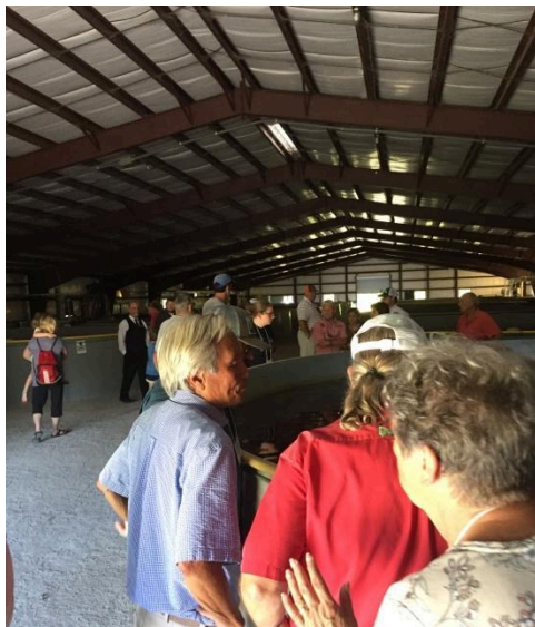
NCACAA members get to visit agricultural operations across the state during state meetings.

In closing, I would like to again welcome you to NC Cooperative Extension. I think you will find the work rewarding. After all, you have joined a group