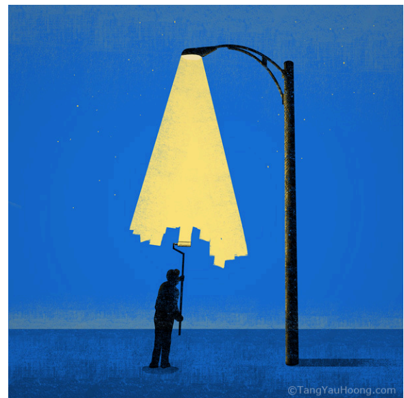
Tang Yua Hoong, Light Painter , 2008 (Above)

Composition: how the parts of a picture are arranged together to make the whole piece