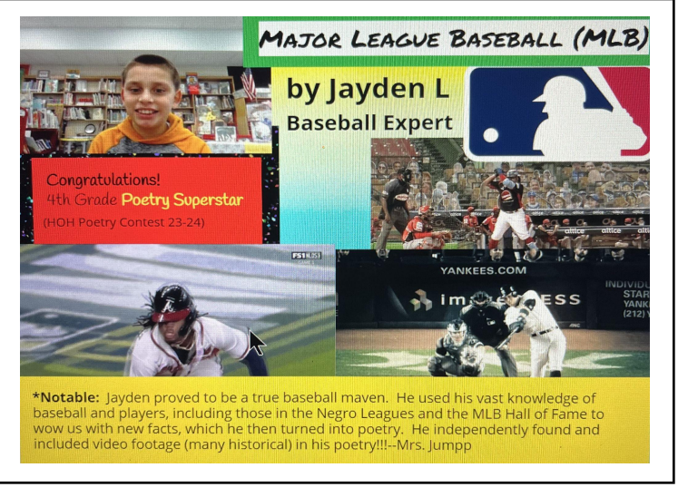
These pictures represent the covers of some scholars' Poetry eBooks