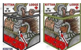
NOAC 2020 Patch

https://drive.google.com/file/d/1ui7yZQeRK5zS3oibk2uZETpjDZi1Ea7m/view?usp=sharing