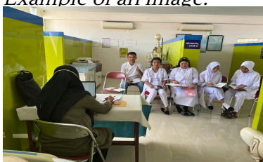
Figure 1: The Team Presenting Material in a Health Education Session.