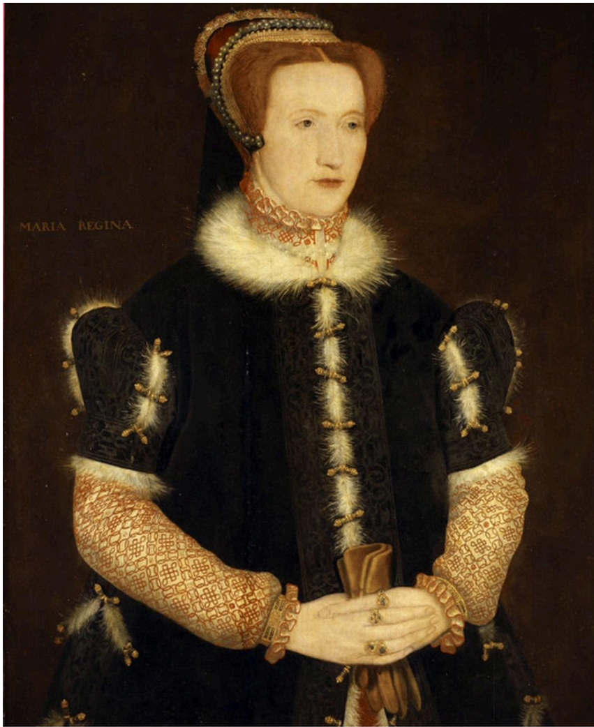
Bess of Hardwick. When this portrait was painted, she was known as Lady St. Loe.