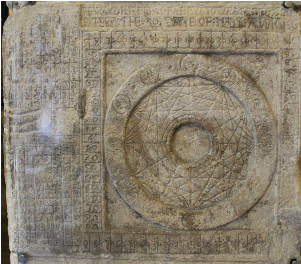
"Hew Draper of Brystow made this sphere the 30 day of Maye anno 1561"