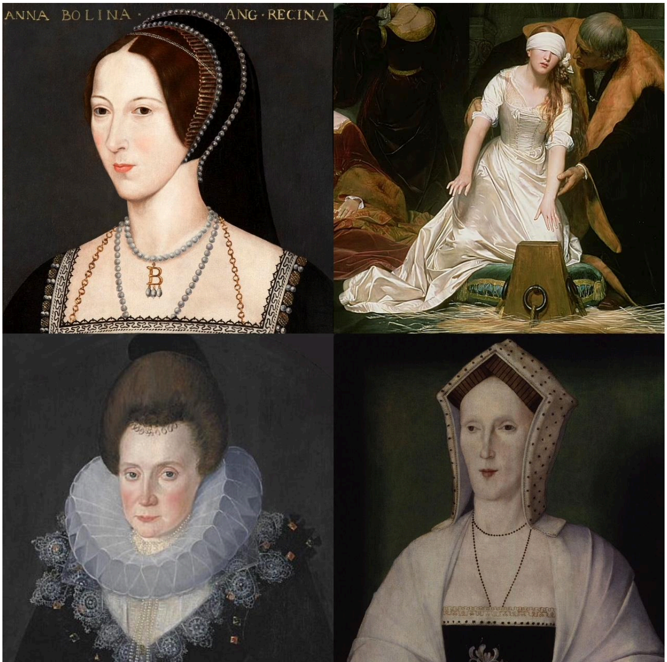
Anne Boleyn, Lady Jane Grey, Lady Arbella Stuart, Margaret Pole / The Countess of Shrewsbury