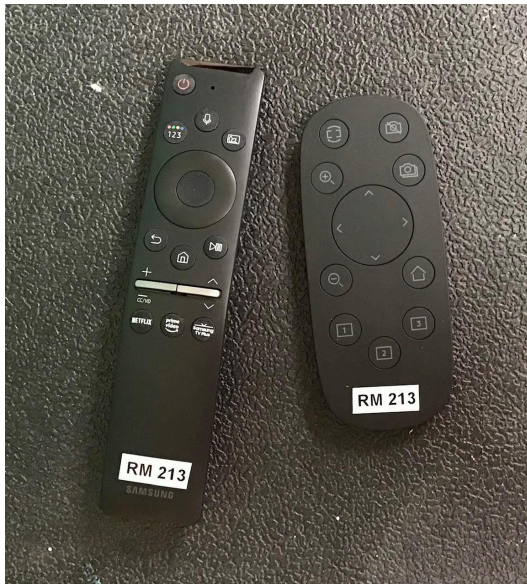
Remote Room Setup