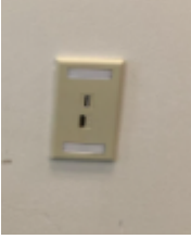
Wall plate picture