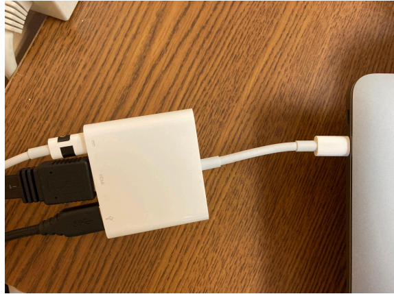
Macbook Connection Picture