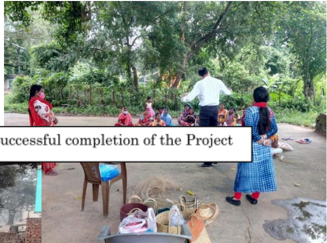
IISCO Certification after successful completion of the Project