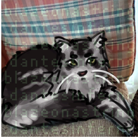
chibi doodles of rambyte's alien goober