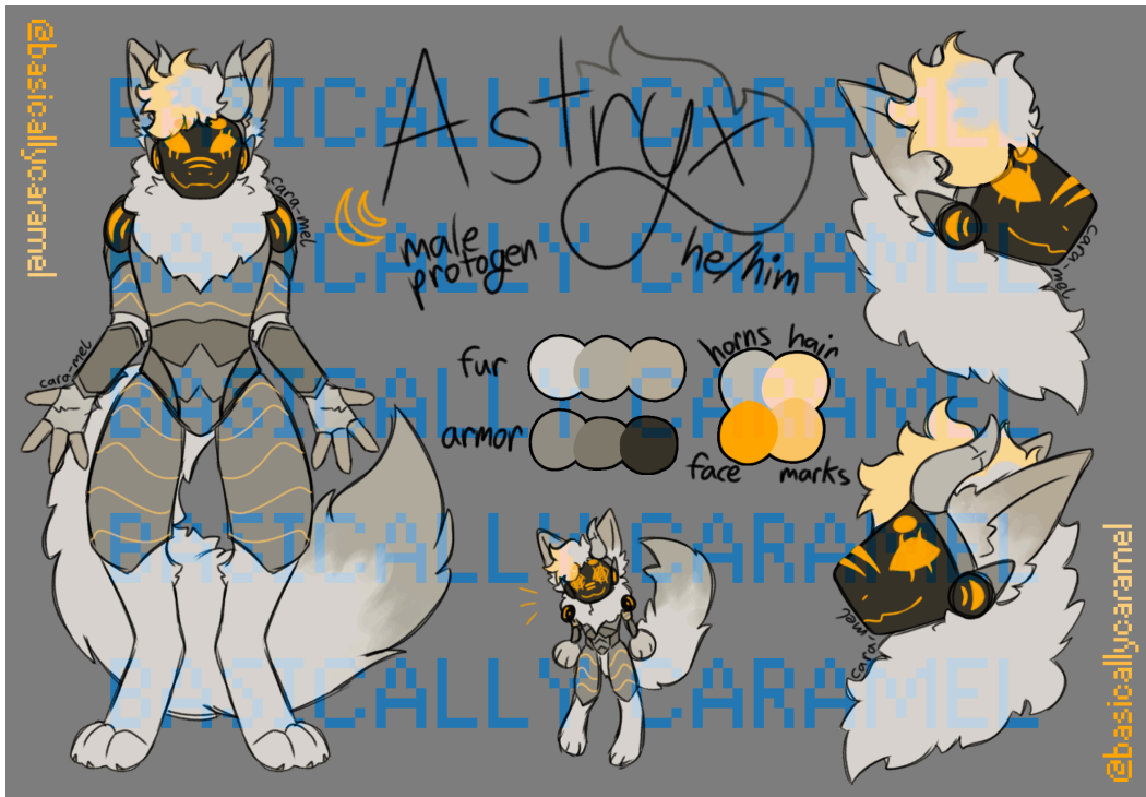
detailed reference sheet