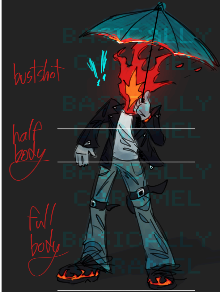
bust shot; just the lines, colored, fully rendered