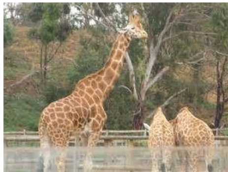
Figure 3 Centered Figure Using “In-Line with Text” Wrap-Style

The figure title is in 10-pt. Times New Roman. The word “Figure” and the number which follows are both bold. The figure title is placed in a new line and italicized. Figure captions should be short and used for the figure name only. They should not be a paragraph long. If needed, any explanations for the figure should be added below the figure.