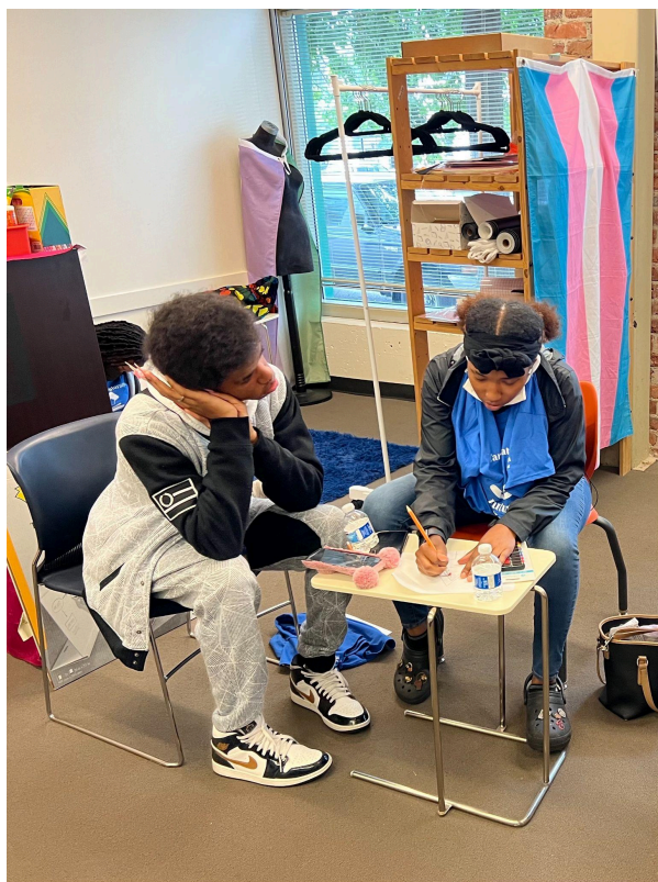
Interns working on a creative activity on the Gay City field trip