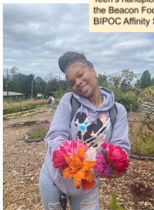
Teen's handpicked flowers at the Beacon Food Forest BIPOC Affinity Space