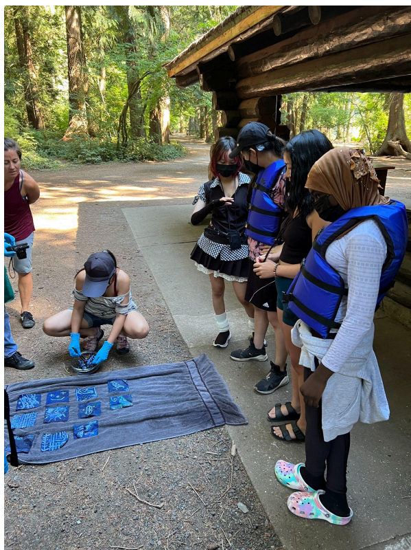
Interns learning Chinese textile dyeing art method on the end of summer camping trip