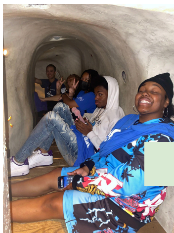
Teens at MoPop Museum