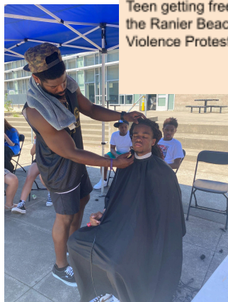
Teen getting free haircut at the Ranier Beach Gun Violence Protest

Other Fun Events : Lots and lots of art projects and art museums (Frye Art Museum, Seattle Art Museum, Van Gogh Experience, etc.) and attending Alaffia Drum Circle and receiving African dance and drumming instruction. We used this variety of activities to facilitate relevant discussions and activities among our cohort.