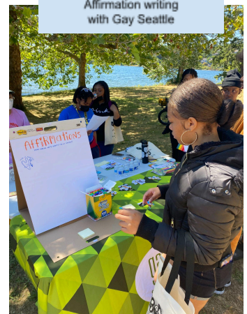
Affirmation writing with Gay Seattle