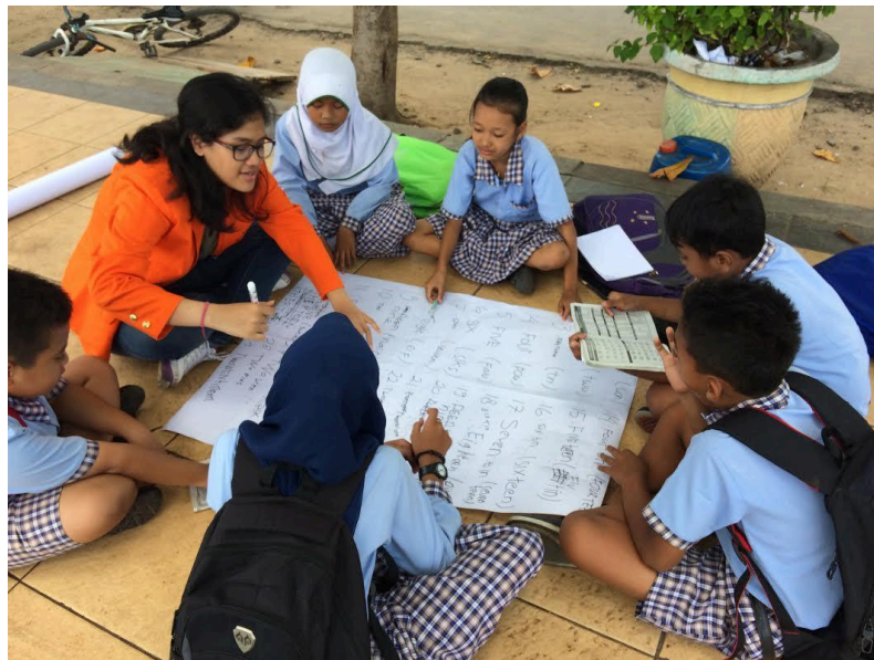
Figure 1. Image Writing Example

the results of data processing, interprets the findings logically, links them to relevant reference sources. [Times New Roman, 12, normal], 1 space. Image format png /jpg.