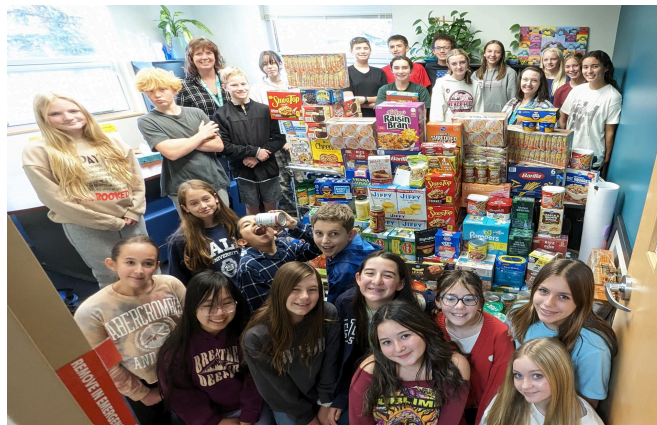
National Junior Honor Society - Food Drive