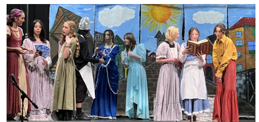
Musical Theater Elective Beauty and the Beast

Middle School students have two+ electives each day. We offer over 45 different electives for students to choose from. Electives may vary from year to year based on student interest and staff expertise.