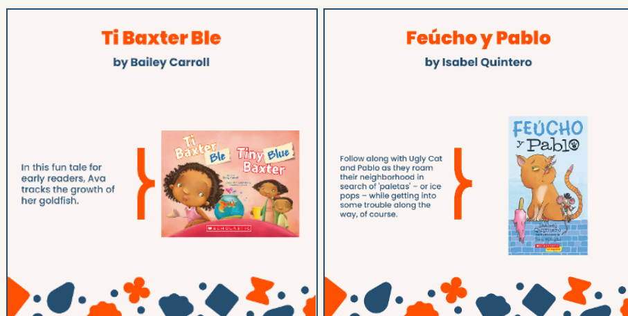
Image preview (only for visual purposes; use link above to download hi-res asset).