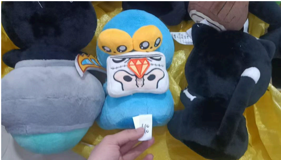
Photo of one of the sample plushies after quality testing (they get completely destroyed). Tests that are done range from the plush toy being set on fire to make sure they follow flammability regulations, are checked on loose parts that could cause choking hazards for young children and the toys are checked for hazardous materials. This is also one of the reasons to be really careful when buying plush toys on temu/shein since any seller can sell their items here without them being quality tested (majority of the toys here are not tested to save costs)

Labeling of the plushies by the manufacturers making sure all required information is on the labels. Somehow this was one of the parts that was most difficult to do. The CE marking that was needed after the safety testing of the toys was 0.2mm too small which caused a good amount of delays 😊