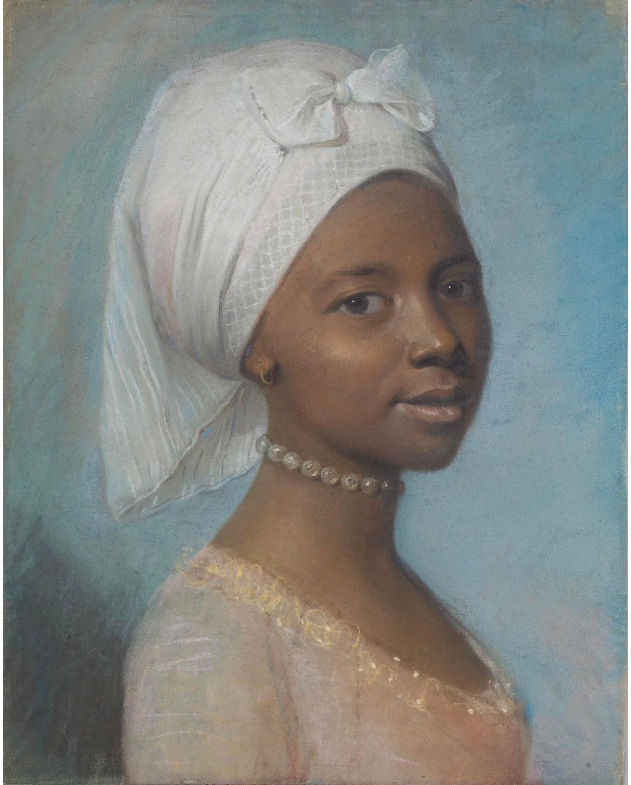
It was painted by Jean Etienne Liotard in 1770...