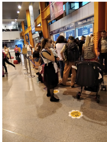
Airport- Photo- E. Acqui