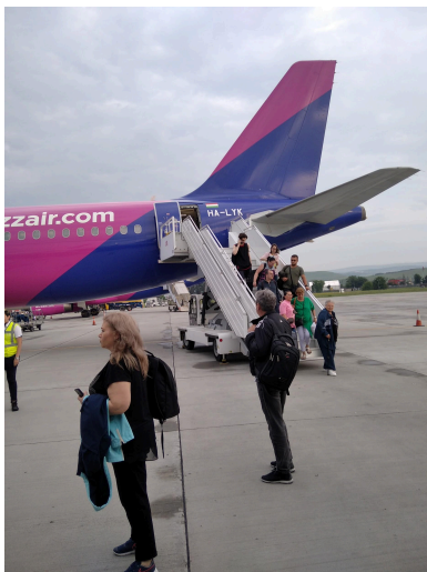
Airport- Photo- E. Acqui

Has your flight ever been cancelled? Take a look at the photos taken at the airport during a flight cancellation. Describe the images.