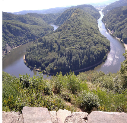
River Saar