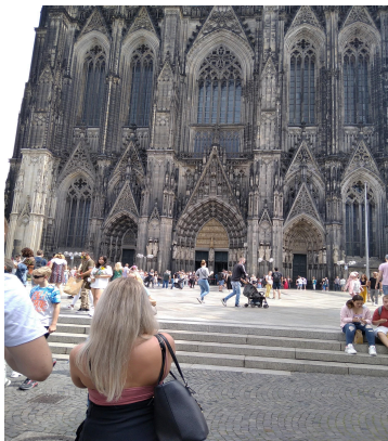
Koln Cathedral