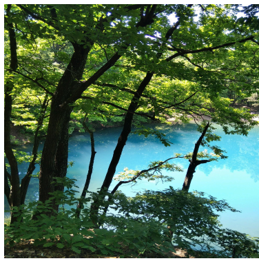
The Blue Lake