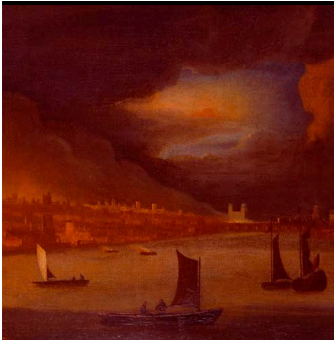
Fig 4. Unknown artist after Waggoner. The Great Fire of London . 1666

Please include the title, year, name of artist/designer and a link to the source