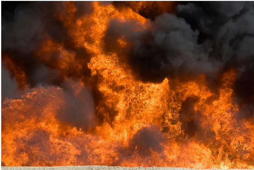
Fig 1. Image of fire

Please insert the images below with a link to the source