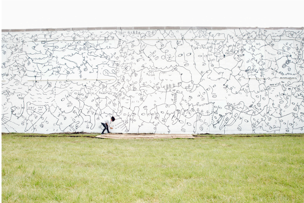
Dance everyday, New York, 2017

lines on white surfaces, which she uses to create intricate and often whimsical designs that incorporate words, symbols, and abstract shapes.