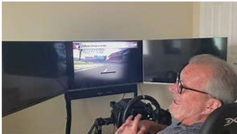
(Video) Meet the future of eSports | YouTube

As an Esports fan, you should get yourself engaged in any community you find interesting and get involved in these events.