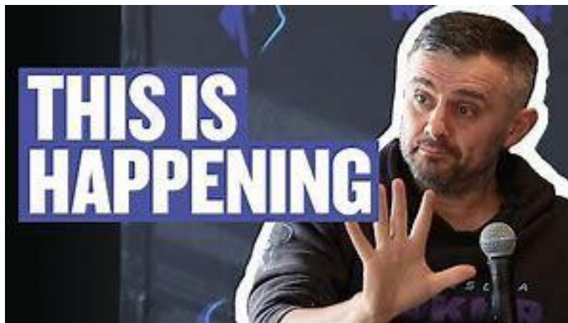
(Video) The Future of eSports is already written | YouTube

More than just introduction of new features, they also promise a real-life adventure for gaming fans. With that being said, let's take a look at the top exciting and important gaming trends every Esports fan should watch out for in 2023.