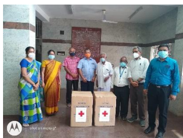
Handover of oxygen concentrators in Tamil Nadu in June 2021.