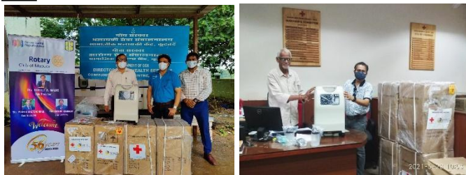
Handover of oxygen concentrators to Goa Medical College and Hospital and to an individual-in-need in June 2021.