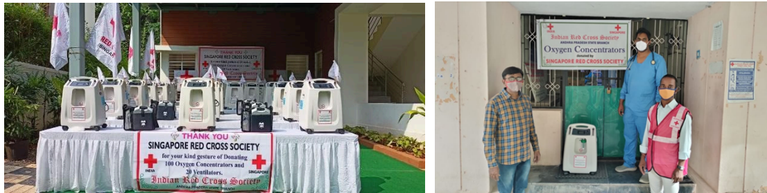
Handover of oxygen concentrators in Andhra Pradesh in June 2021.