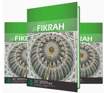
Figure 1. Image title

Graphics include images, so writing graphics is the same as writing images. The location of the graph must be centered (centered). The graphic title is placed at the top in Book Antiqua font, size 10, Bold. The writing on the X and Y coordinates must be clear and information can be placed below the graph.