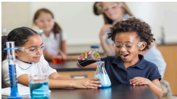
Figure 2. Attached figure in article

The figures must be arranged as example below: